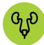
PATHOLOGY OF THE UROGENITAL SYSTEM