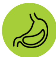
PATHOLOGY OF THE GASTROINTESTINAL SYSTEM