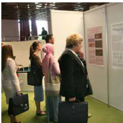
A guide to making a poster Poster dimensions 100x70cm, vertical orientation

For a summary to be published in Acta Medica Saliniana the registration fee for participation in the Congress, of the author presenting the work, should be paid by June 30th, 2024. at the latest. In case the fee is not paid, the summary will not be published in Acta Medica Saliniana.