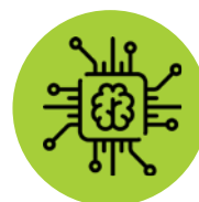
PATHOLOGY OF THE CENTRAL AND PERIPHERAL NERVOUS SYSTEM