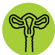
PATHOLOGY OF THE FEMALE GENITAL SYSTEM AND BREAST